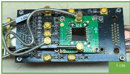
Wired sample before cryogenic cooling

Quantum computing (QC) is currently pushing further the frontier of information technology. Among other fields, solid-state spin qubits and superconducting qubits are promising research areas for QC. Recently our laboratory has developed a new platform for quantum devices based on heterostructures embedding a high mobility germanium hole quantum well. With these heterostructures, we have recently been able to demonstrate our ability to fabricate functional quantum dot devices and Josephson junctions. To further develop this platform, we are currently optimizing the heterostructure to decrease the interface defect density, hence increasing the mobility of the hole gas. In that prospect, we are looking for a talented and motivated Master student to design, fabricate and measure structures to probe the quality of the germanium quantum well.